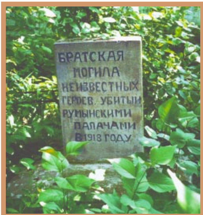
■ Memorial to victims of a Romanian pogrom in 1918–1919. “Fraternal grave of the unknown heroes killed by Romanian executioners in 1918” (photo, 1998)