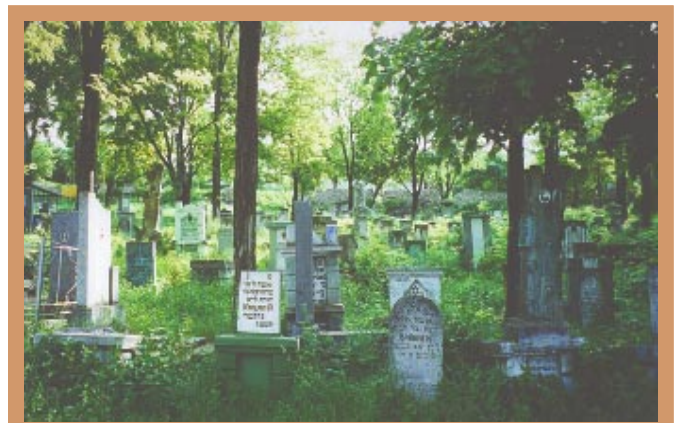
■ Jewish cemetery, 1998