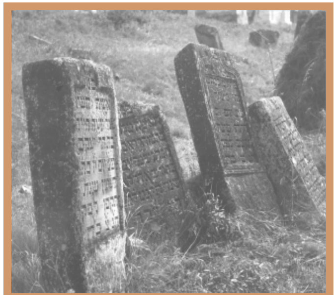
Jewish cemetery, 1966