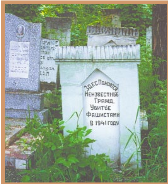
"Here rest the unidentified citizens, killed by the fascists in 1941" (photo, 1998)