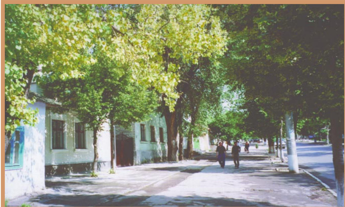
Former Jewish district, 1998