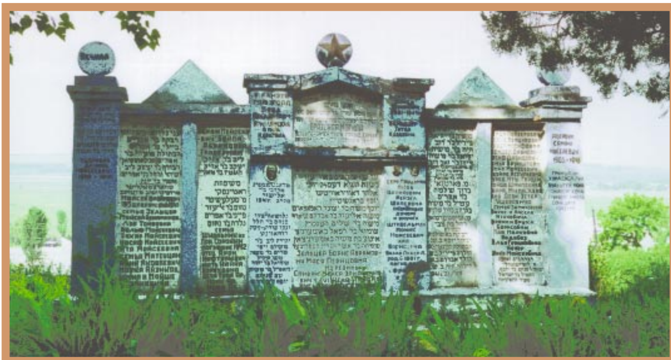
Memorial to Holocaust victims, 1998