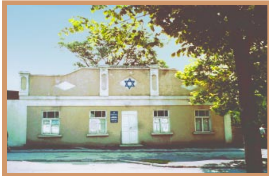
■ Synagogue, 1998