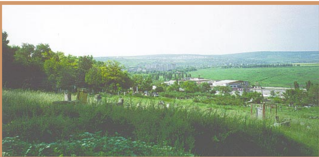
Jewish cemetery, 1998

6,408 (41.9% of general population in 1930)