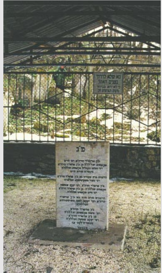
■ Holocaust memorial, 1995