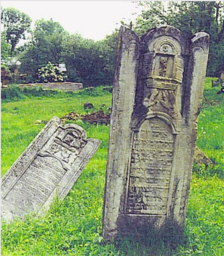
■ Jewish cemetery, 1995